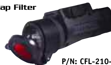
P/N: CFL-210-A2 (Red) CFL-210-A3 (Opaque) CFL-210-A4 (IR)