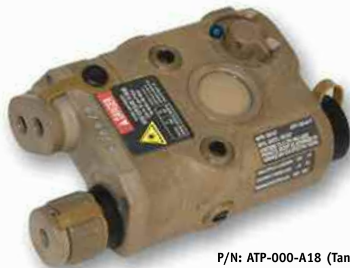
P/N: ATP-000-A18 (Tan) ATP-000-A22 (Black)