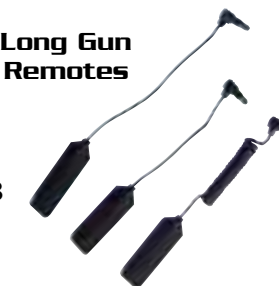
P/N: CFL-053-8 CFL-053-4 CFL-310