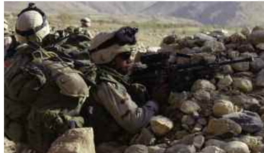
Department of Defense