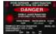
AN/PAQ-4C/Infrared Aiming Light