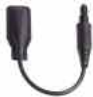
Plug Style Remote