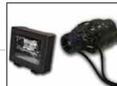
Insight's Ultra VOx® Image