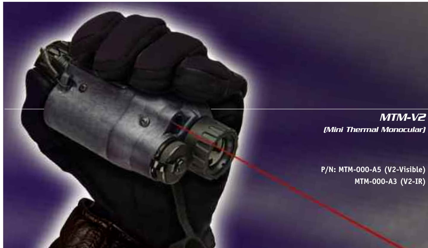
MTM-V2 (Mini Thermal Monocular)

P/N: MTM-000-A5 (V2-Visible) MTM-000-A3 (V2-IR)