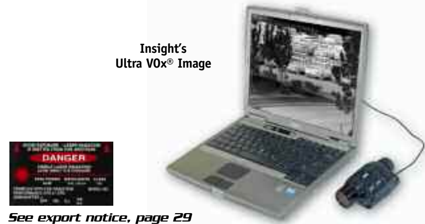
See export notice, page 29

Insight listened to the user feedback on the Mini Thermal Monocular MTM and responded with the MTM-V2 . The MTM-V2 is a more cost-effective method of putting the industry-leading thermal vision miniaturization and resolution into the hands of more law enforcement agencies and first responders. The MTM-V2's cutting edge micro-bolometer technology enables easy thermal detection, recognition and identification of a moving man sized target at 500 meters through a variety of light and weather conditions. This life saving technology recently won the New Hampshire High Tech Council's prestigious Product Of The Year Award! The MTM-V2 is more evidence of Insight's continuous efforts to take cutting-edge military inspired designs and put them in your hands, the hands of the men and women on the job, every day and every night. Dominate the Darkness with the MTM-V2!